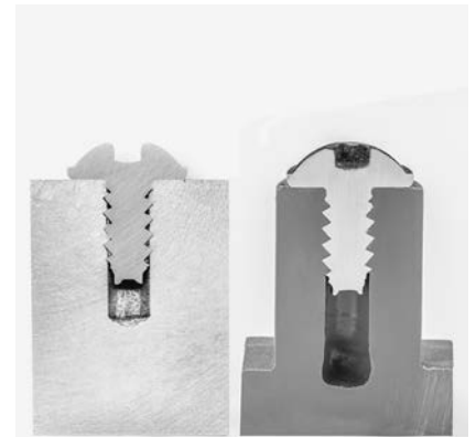
High flank coverage can be achieved for screw connections in light metal casting alloys and plastics