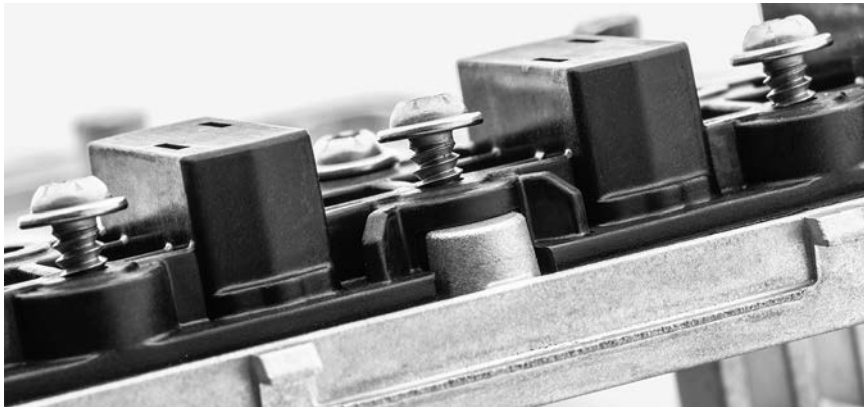
b&m-FORM LG® Vario screw connection in an application made of zinc die cast and thermoplastic