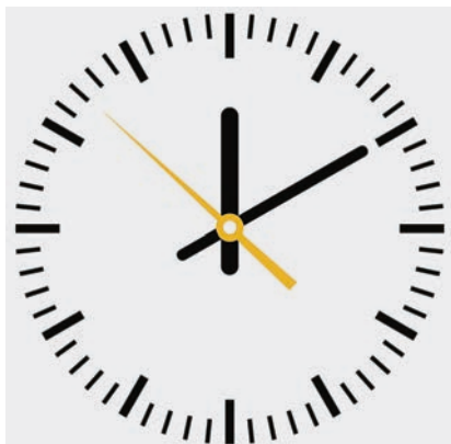
The focus is on the optimization of process times