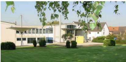
Group headquarters in an idyllic location in Ober-Ramstadt near Frankfurt