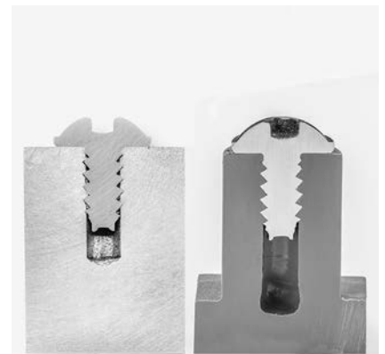
High flank coverage can be achieved for screw connections in light metal casting alloys and plastics